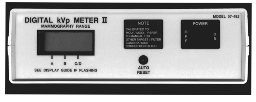
Figure 1-1. Front Panel Indicators and Controls

An overrange kVp condition indicates that the measured kVp is above the calibrated range. An underrange kVp condition indicates that the measured kVp is below the calibrated range.